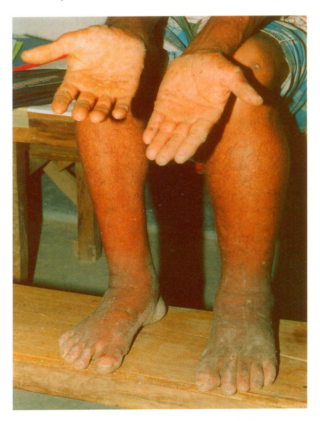
Figure 2. Nonpitting edema of legs with keratosis in a patient of arsenicosis.

The evidence of carcinogenicity in humans from exposure to arsenic is based on epidemiological studies of cancer in relation to arsenic in drinking water. The working group of International Agency for Research on Cancer [3] evaluated data from ecological, cohort, and case—control studies from many countries and observed that arsenic was